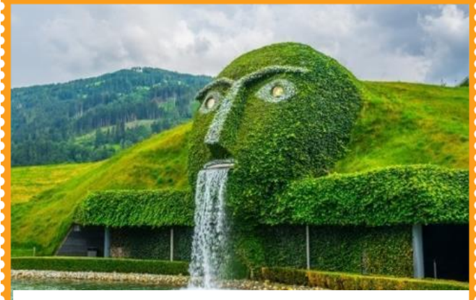
Swarovski Kristallwelten Wattens

Drive to Vaduz, the capital at the Principality of Liechtenstein with a guided mini train ride. Visit Swarovski Crystal Museum – the dazzling world of crystals. Visit Innsbruck – The Tyrolean capital of picturesque Austria.