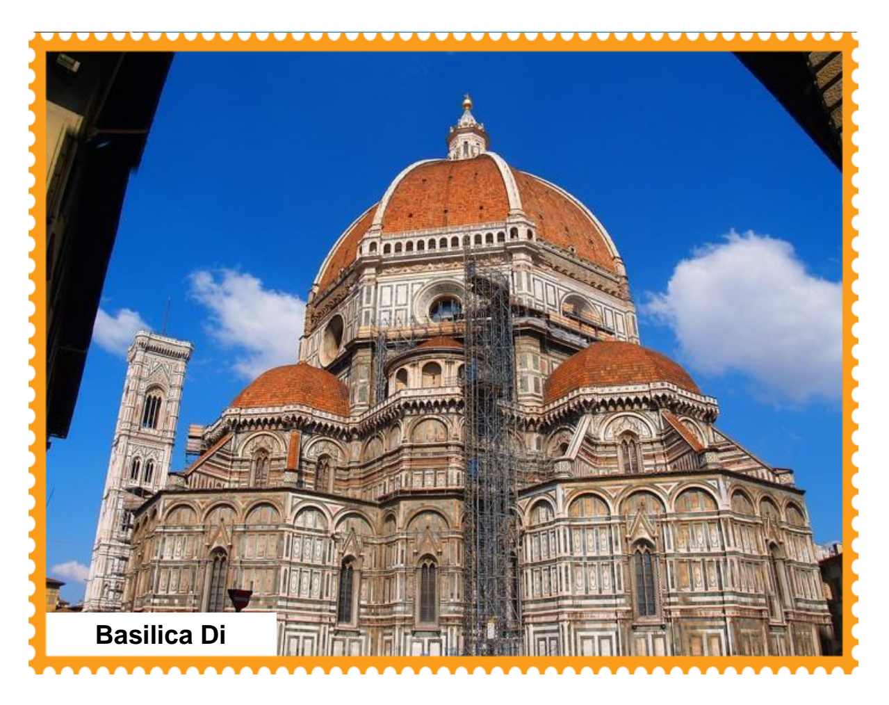
Day 11 Guided city tour of Florence. View the Duomo – Florence most iconic landmark. View the remarkable and famous Leaning Tower of Pisa.

This morning, after checking out from your hotel, we'll embark on a journey to Florence, often referred to as the cradle of the Renaissance. Accompanied by an English-speaking local guide, you'll immerse yourself in the rich culture of this historic city.