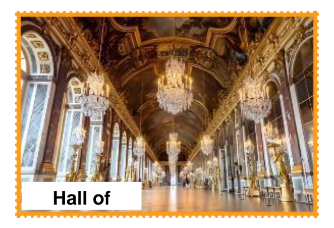
Day 2 Experience a guided city tour of Paris, including a visit to the Eiffel Tower's 3rd (Top) Level. Visit the Palace of Versailles, a testament to the pinnacle of French 17th-century artistry and achievement.