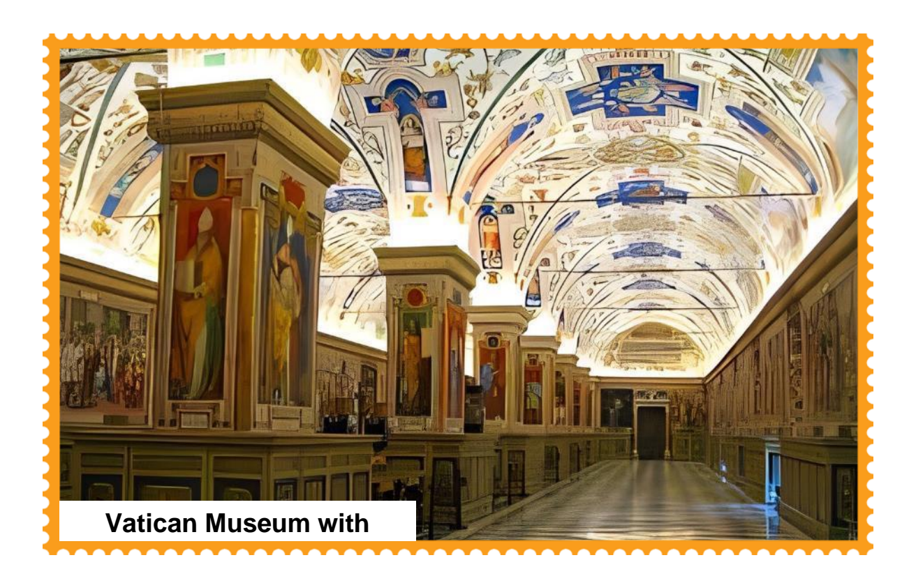
Day 12 Trip to the eternal city of Rome. Visit the world's smallest country – the Vatican City and St. Peter's Basilica

Today, it's time to check out and make our way to the eternal city of Rome. Prepare for an orientation city tour of Rome. Our stop is the Vatican City, the world's smallest country. (Please note that shorts or sleeveless vests are not allowed in the Vatican.)